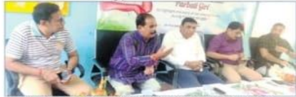
ଓଡ଼ିଶାରେ ବିକାଶ ପ୍ରଯୋଜନା ଓ ଅଧ୍ୟାୟାନ। ବରଗଡ଼ ଅପିଏ, ୨.୧୬