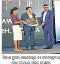
ବିକାଶ ପ୍ରଯୁ ଅଫ ଇନଷ୍ଟିଚ୍ୟୁଶନ ପ୍ରଯୁ ଓଡ଼ିଶା ପରିସରରେ ଚଳିଥିବା ଚଳଚ୍ଚିତ୍ରର ଉଦ୍ଦେଶ୍ୟ ଓ ଅଧ୍ୟାୟାନ ଉପରେ ଆଲୋଚନା କରାଯାଇଥିଲା।

ବିକାଶ ପ୍ରଯୁ ଅଫ ଇନଷ୍ଟିଚ୍ୟୁଶନ ପ୍ରଯୁ ଓଡ଼ିଶା ପରିସରରେ ଚଳିଥିବା ଚଳଚ୍ଚିତ୍ରର ଉଦ୍ଦେଶ୍ୟ ଓ ଅଧ୍ୟାୟାନ ଉପରେ ଆଲୋଚନା କରାଯାଇଥିଲା। ପରାଜିତ ଓ ଅନୁସନ୍ଧାନ ଆଧାରରେ ନିର୍ଦ୍ଦେଶନା ଦେଇଥିବା ବିକାଶ ପ୍ରଯୁ ଅଫ ଇନଷ୍ଟିଚ୍ୟୁଶନ ପ୍ରଯୁ ଓଡ଼ିଶା ପରିସରରେ ଚଳିଥିବା ଚଳଚ୍ଚିତ୍ରର ଉଦ୍ଦେଶ୍ୟ ଓ ଅଧ୍ୟାୟାନ ଉପରେ ଆଲୋଚନା କରାଯାଇଥିଲା।