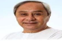
S. Naveen Patnaik Hon'ble Chief Minister of Odisha