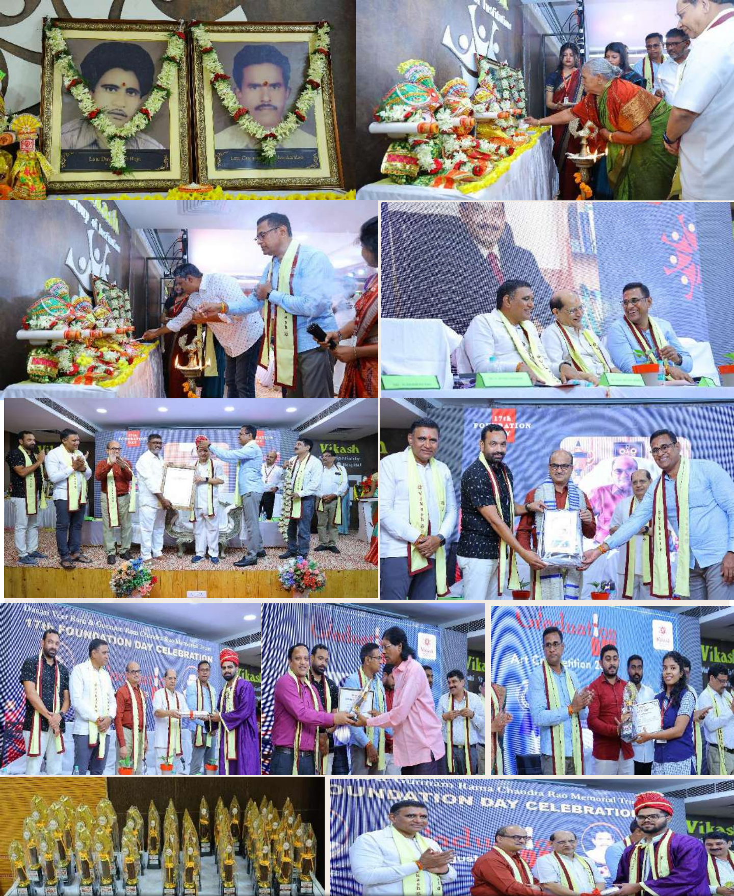
Highlights of FOUNDATION DAY