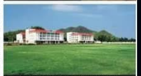
Vikash Residential School, Bhawanipatna

ensures high degree of performance in State and National level.