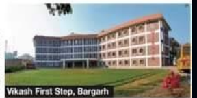
Vikash First Step, Bargarh

The receipt of Governor's Trophy and Chief Minister's Trophy by the students, is the authentication of its remarkable facilities and guidance in the field of dance, music, painting to explore their passions through extra-curricular and co-curricular activities. It always encourages & provides means to its students to balance their pursuit for sporting passion through well developed infrastructure and training through professional coaches without compromising on their academics which