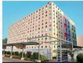
Vikash The Concept School, Sambalpur