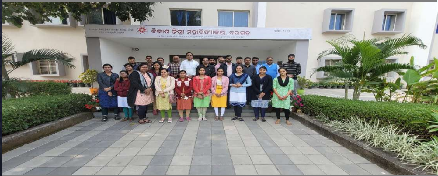
Revered Principal & Team VDC on New Year Day