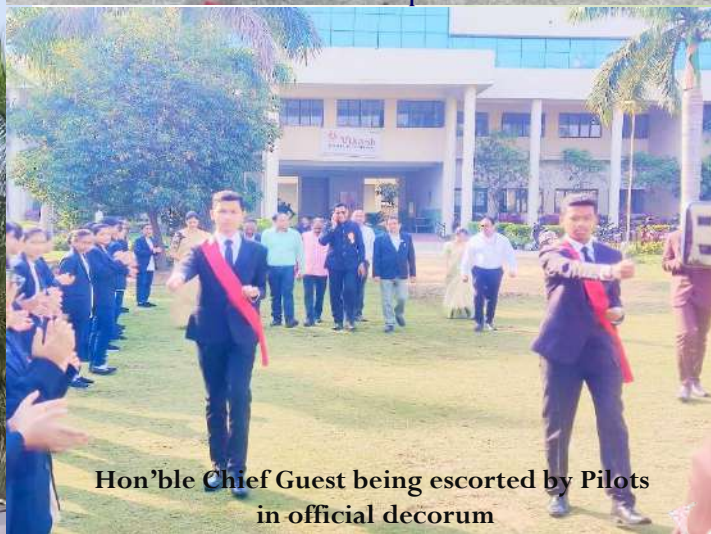
Hon'ble Chief Guest being escorted by Pilots in official decorum