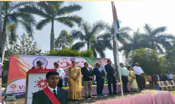
The Administrators of VHEI Campus with the LEADER