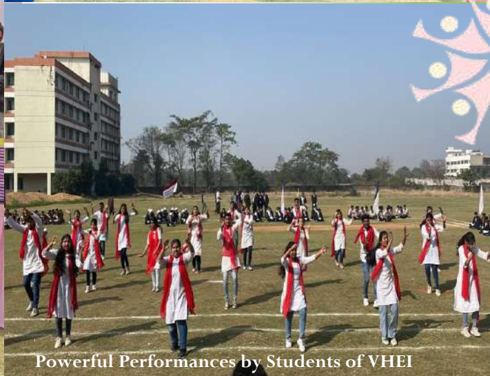
Powerful Performances by Students of VHEI

'TALENT WINS GAMES, BUT TEAM WORK AND INTELLIGENCE WINS CHAMPIONSHIPS. '