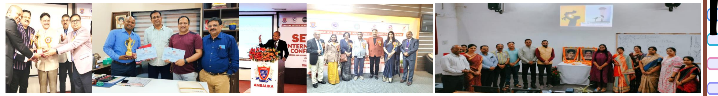
BEST PAPER AWARD AT COII2024 @AIMT,LUCKNOW (UP); APPRECIATED BY MANAGEMENT & ADMINISTRATION at VGI

THE R & D Cell has registered a series of achievements that symbolizes the Academic Churning going on in the Campus & the Academic Aura and ambience surely ensures the students that they are in the safe hands. Publication of Research Journals, Presentation of Papers at National and International Conferences & Appreciation for the Best papers Presented are few achievements that makes the head turn and hats off. Thankful to esteemed Management of Vikash Group of Institutions and Leadership of Vikash Degree College, Bargarh for resonating in sync with the global updates.