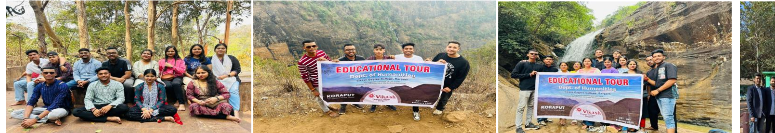
HUMANITIES STUDENTS AT KORAPUT: DEOMALI, DUDUMA, RANI DUDUMA, SABARA SRIKHSETRA, TRIBAL MUSEUM